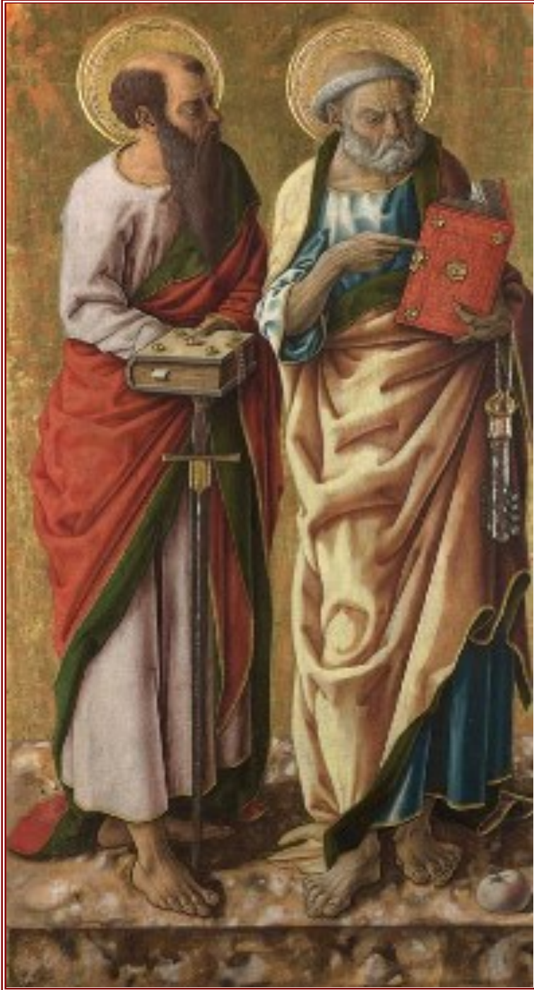
Carlo Crivelli, Saints Peter and Paul, probably 1470s Tempera on poplar, 93.3 x 47 cm, The National Gallery/NG200 https://www.nationalgallery.org.uk/paintings/carlo-crivelli-saints-peter-and-paul