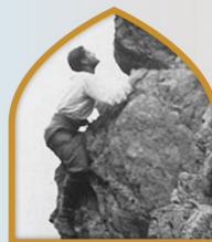
Bl. Pier Giorgio Frassati

"The world offers you comfort. But you were not made for comfort. You were made for greatness." -Pope Benedict XVI