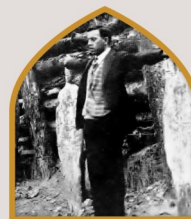
Bl. Miguel Pro

"True greatness is not found in a name but in the soul."