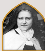
St. Thérèse of Lisieux

"Jesus is with me. I have nothing to fear."